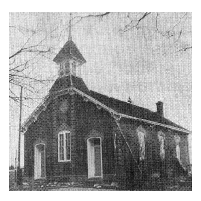
The Orton School was known as Union School No. 2, and is now a private residence.

Orton Public School was closed in June 1964. In September, pupils were taken by bus from Erin Township to the Central School in Hillsburgh; and pupils from East Gara. were taken to Marsville. Orton School is now a private residence.