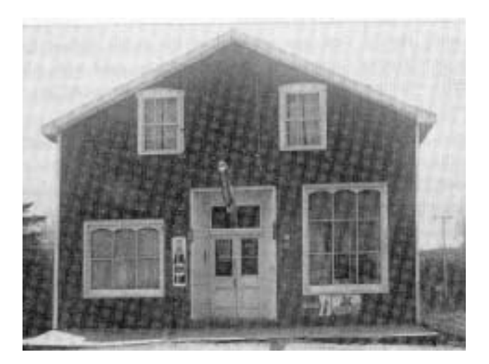
How's Store, Hillsburgh

Hydro was first used for street lighting in 1921.